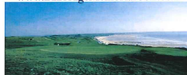
This photo was taken by an Ireland trip winner.

Driver's License & Photo I.D. will be required by Joint Base McGuire-Dix-Lakehurst on 5/2/15 License # and State need to be listed on registration form Two Week PRIOR to event for security clearance